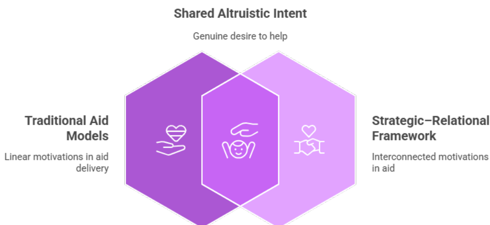
Figure 2 Comparison of traditional aid models with China’s strategic–relational framework.